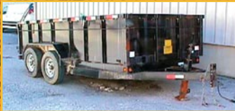
TANDEM SELF-DUMPING TRAILER

Sale Date: Saturday, November 1, 10:00 A.M.