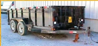
TANDEM SELF-DUMPING TRAILER

Sale Date: Saturday, November 1, 10:00 A.M.