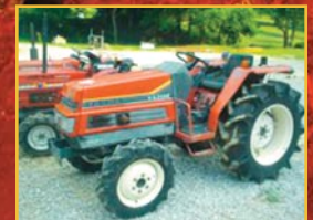
36 HP YANMAR TRACTOR, 1,900 HOURS