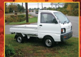
MITSUBISHI MINICAB UTILITY TRUCK