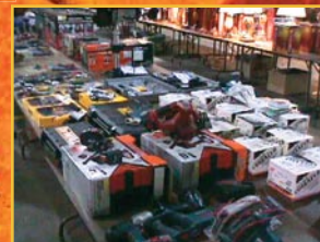
VIEW OF TOOLS

(100+) New DELTA Power Tools, you name it we have it! Drill Presses; Cutoff Saws; Tile Cutters; Light Bulbs; Linoleum; Lawn Mowers; Line Trimmers; Ceiling Fans; Roofing Shingles; Copper Wire; Lights; 7,500 W and 3,700 W Gas-Powered Generators; 1,700 PSI Power Washers; 2,400 PSI Gas Power Washers; 20-Gal. 5 Hp. Air Compressors; 2-Ton Pneumatic Engine Hoists; 12-Ton Shop Presses; Lots of Cordless Power Tools; 115V Stick Welders; COSCO Alum. Folding Ladders/Scaffolding; Mailboxes; 3- and 3-1/2-Ton Floor Jacks; FLO TECH Alum. Engine Headers; ATV Alum. Loading Ramps; Alum. Race Car Jack Stands; BLACK & DECKER Power Tools; Combo Sets; 18V and 24V Cordless Drills; Air Tanks; Elec. Radiator Heaters; Air Impact Tools and Sockets; STANLEY Tools; Eyeglass Display Stands; Brush Cutters; Levels; Clamps; Saw Blades; Laser Levels; Pipe Wrenches; Tool Chests; Oxy./Acty. Sets; Welding Supplies; 14" Abrasive Saws; Worm Drive Saws; Line Trimmers; Blowers; Chainsaw; Work Tables; Fluorescent Lights; 125 Amp Load Centers; Adjustable Shutters.