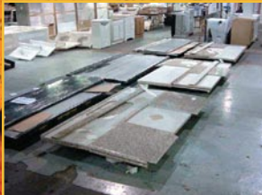
GRANITE COUNTERTOP SETS