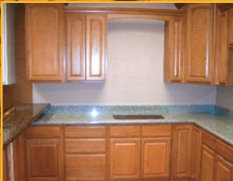
GOLDEN OAK KITCHEN