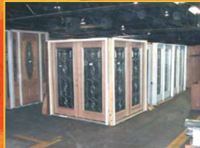
BEVELED GLASS ENTRY DOOR