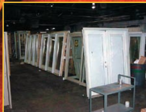
VIEW OF PATIO DOORS