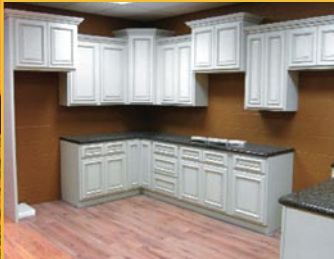
WHITE DESIGNER KITCHEN