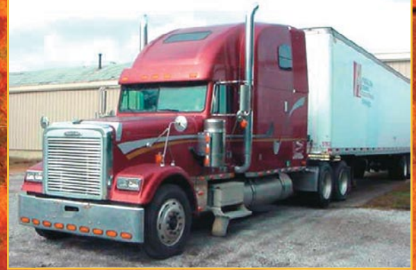
2001 FREIGHTLINER XL CLASSIC

2001 FREIGHTLINER XL Classic Semi Tractor, great tractor; 14' Self-Dumping Tandem Trailer; MITSUBISHI MiniCab Utility Truck, 3-cyl. gas, 6' drop side bed, great jobsite utility truck; 36 Hp. Estate Tractor; 1991 MERCEDES 300D, just serviced.