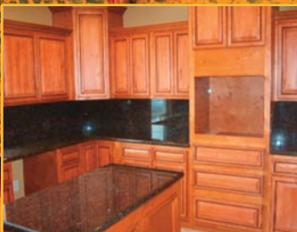
CHERRY CUSTOM KITCHEN