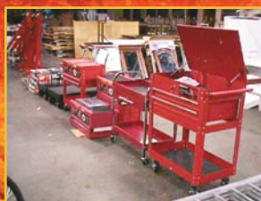
MECHANIC'S TOOLBOXES & CARTS