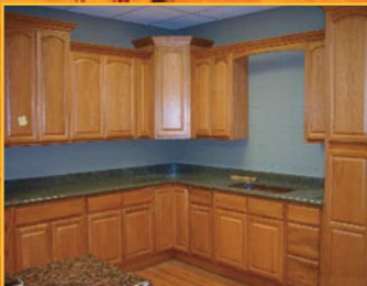
OAK CATHEDRAL TOP KITCHEN