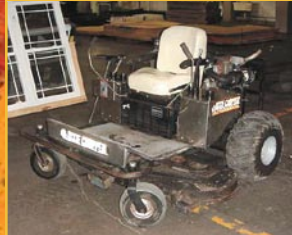
DIXIE CHOPPER 60" MOWER